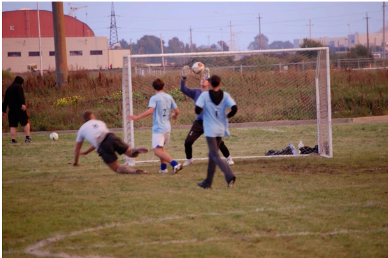
Time stands still.....