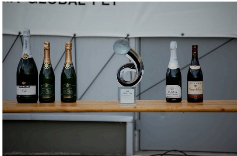
The KVP Charity Cup trophy...