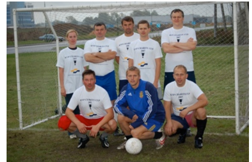
FEZ - ARGUS