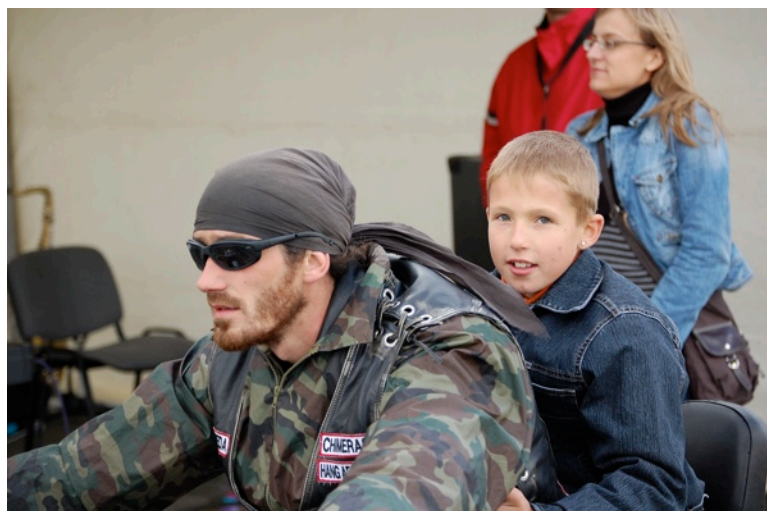
Klaipeda Motorcycle Club stop by to give a lift...