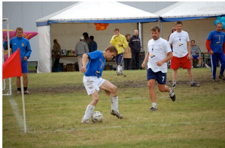
Europart showing their skills...