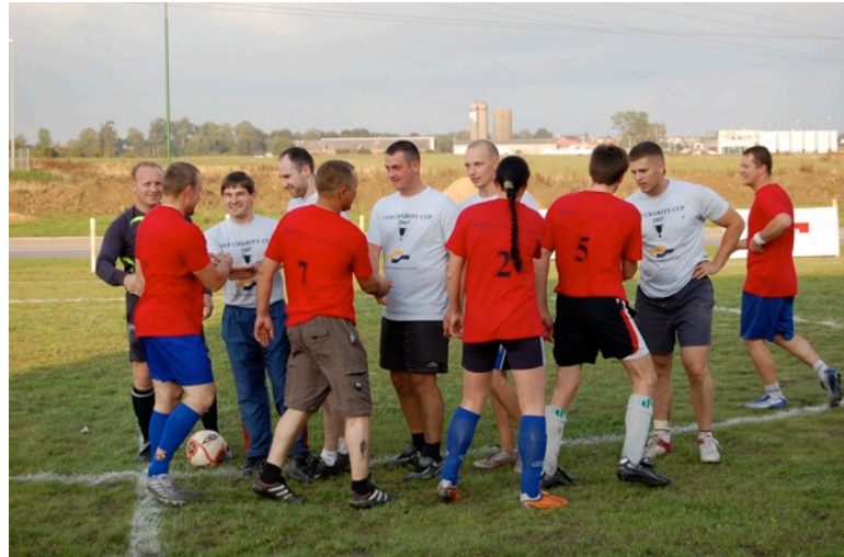
Sekmes, Laimingai, GOOD LUCK !....