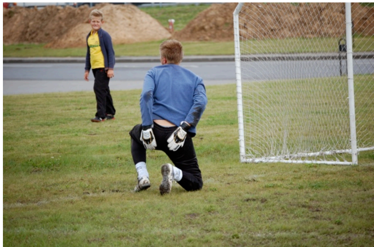
No pain no gain...