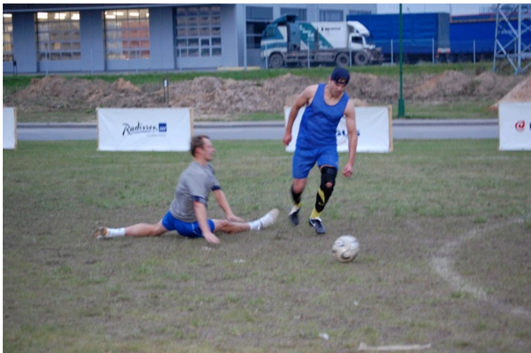
Painful sports play...