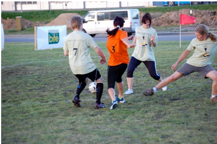
Not only a mans game...