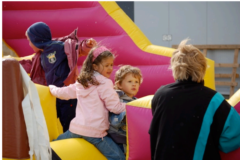
Children enjoying the days activities...