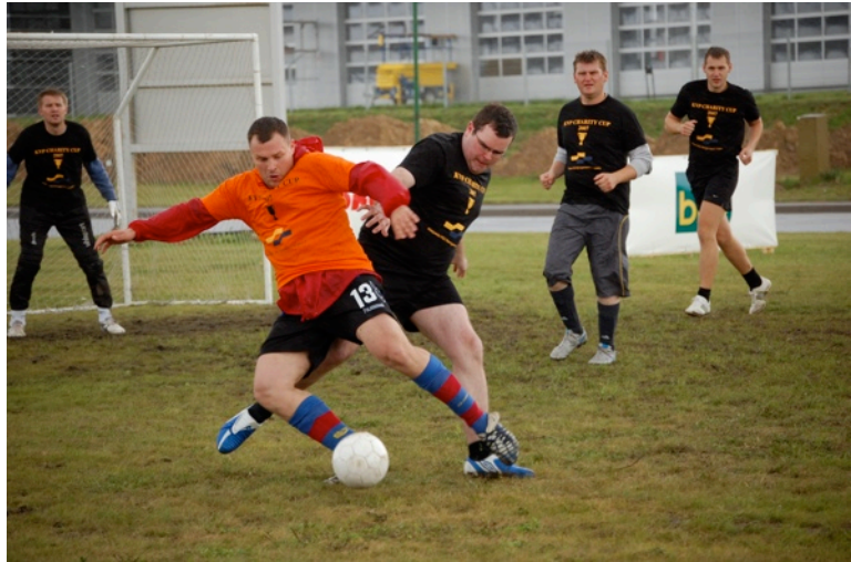
Battle for the ball...