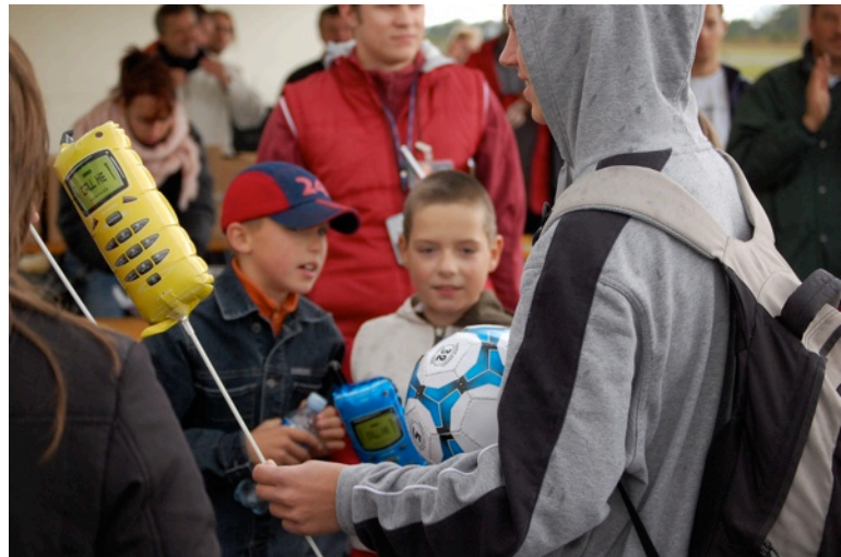
Gifts from our Sponsors...